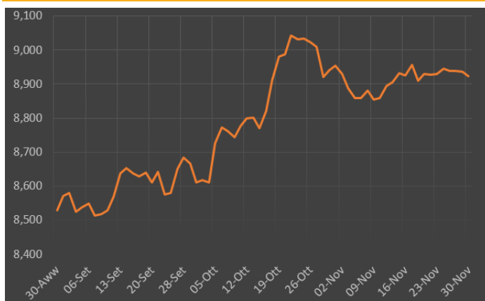
Chart of the week: Go plc shares in November